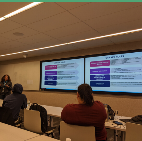
UIS meeting Feb 2020