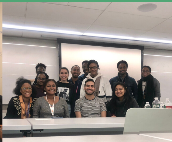
Meet the Mentor Series Feb 2020