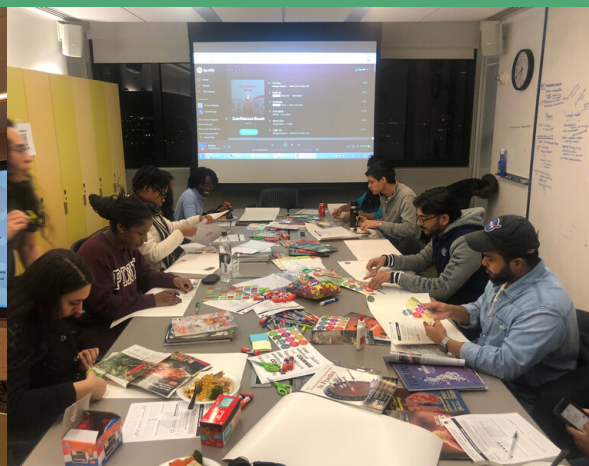
Goal setting workshop Jan 2020